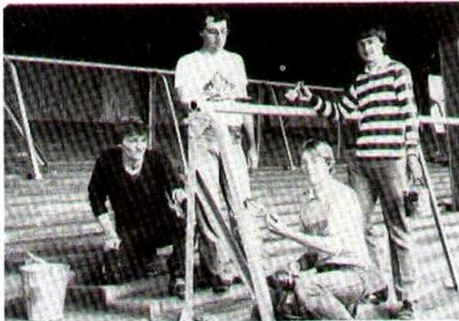
Spic and span — four young volunteers busy at work painting the barriers throughout the ground during the close season.