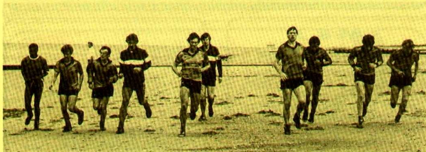
I do like to be beside the seaside — the Blues squad in training on the Skegness beach.